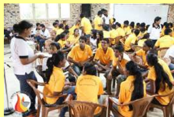
Group discussions in session