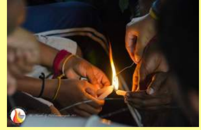
Campers sharing the light of one candle during the Unity Candle Lighting Ceremony —Unity Camp 6, Kilinochchi

| Credit cash/cheque to: Ekamuthu Oray Makkal Unity Mission Trust | Bank: People's Bank | A/C No: 014100180004373 |