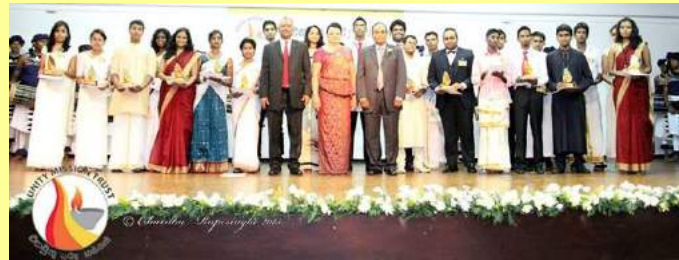
Unity & Integration Award Winners with Founder of UMT, Chief Guest & Chairman of UMT

On the 13 th of September 2013, Unity Mission Trust presented a fusion of culture and talent as it brought together one hundred young leaders representing different regions of Sri Lanka at the Sri Lanka Foundation Institute in Colombo. The occasion was graced with the presence of the First Lady of Sri Lanka, Mrs. Shiranthi Wickremasinghe Rajapakse, who attended the event as the Chief Guest. The evening unfolded with a beautiful procession of all one hundred leaders who were present dressed in their traditional attire for the occasion, each of them carried in their hands a white lotus, . . .