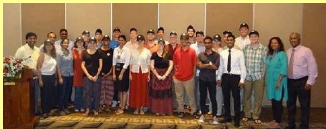
Students and Professors from Davidson College with Team UMT