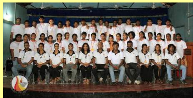
The Group Leaders and the Seniors members of UMT