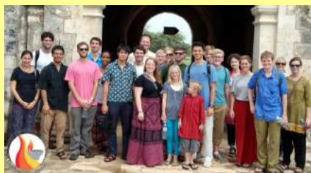
Davidson College group in Jaffna