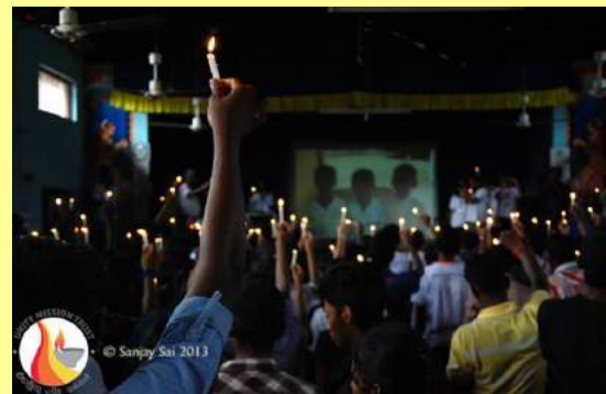
The Unity Candle Lighting Ceremony